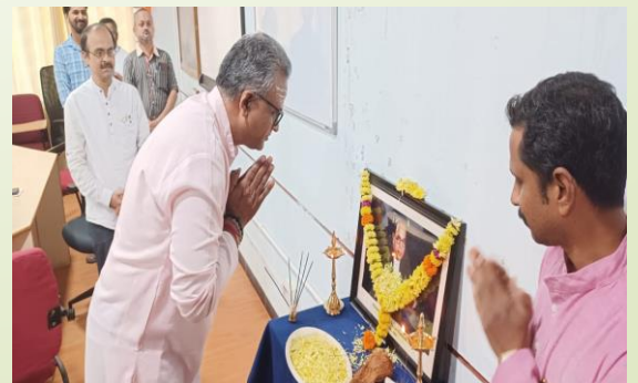
68th Mahaparinirvan Diwas of Dr B R Ambedkar observed in CMDR