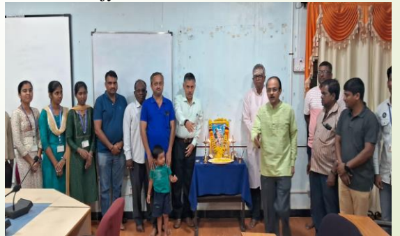
Kanakadas Jayanti celebrated in CMDR