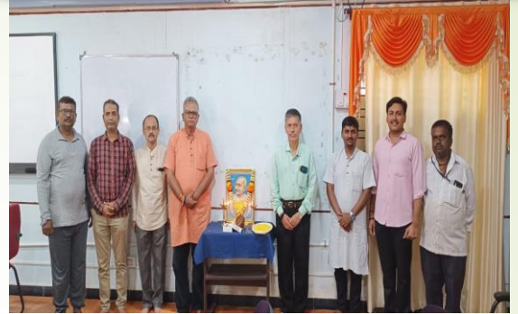
Mahatma Gandhi Jayanti celebrated in CMDR