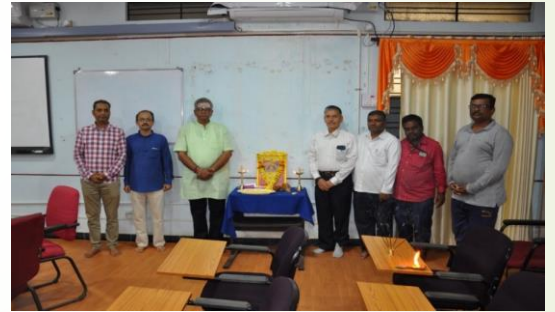
Kannada Rajyotsava celebrated in CMDR