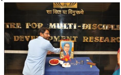
CMDR Celebrated the Birth Anniversary of Dr. B. R. Ambedkar on 14 th April 2023